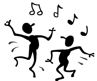
Birthday Celebration for our students involves parents coming out to volunteer!